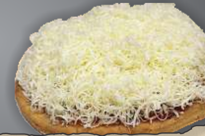
Indian Style Bhakri Pizza

Indian Style Bhakri Pizza ..... $ 7.99 (Onion, Capsicum with Cheese)