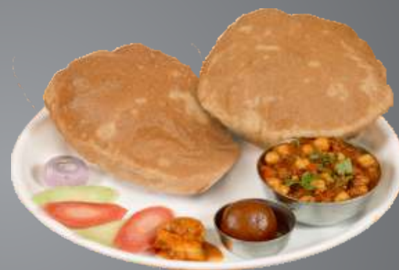
Chana Puri... @ $ 9.99 (Chick peas Curry, served with Puffed Bread (puri), Achar, Salad and Gulab Jamun)

Most option can be prepared (Mild, Regular & Hot)