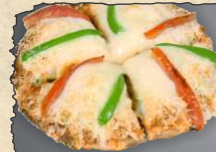
Cheese Baked Pizza