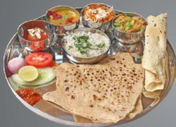
Punjabi Thali... @ $ 11.99 (Gravy Subji, Dry Subji, Paratha, Dal, Rice, Papad, Gulab Jamun)